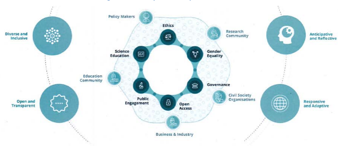
Figure 2: RRI – Key issues and process dimensions

Research, innovation and technological developments leading to societal changes and new products in the markets, need to be addressed in a coherent way based on a framework for Responsible Research and Innovation (RRI). This call refers to a framework adapted from the former Engineering and Physical Sciences Research Council in the UK (2013) as well as from The Research Council of Norway's RRI-framework (2015). This approach to RRI is also endorsed by the European "RRI-Practice project" (<a href="www.rri-practice.eu">www.rri-practice.eu</a>). RRI invites us to deliberate fundamental questions related to what kind of futures we want science, technology and innovation to bring into the world (see Annex 3). Key issues and process dimensions of RRI are shown in figure 4.